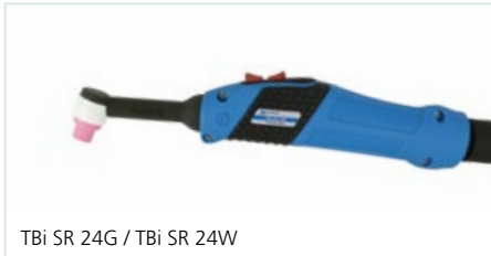
TBi SR 24G / TBi SR 24W