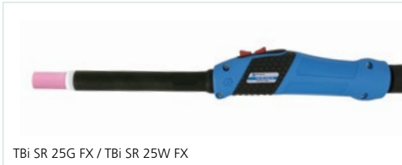
TBi SR 25G FX / TBi SR 25W FX