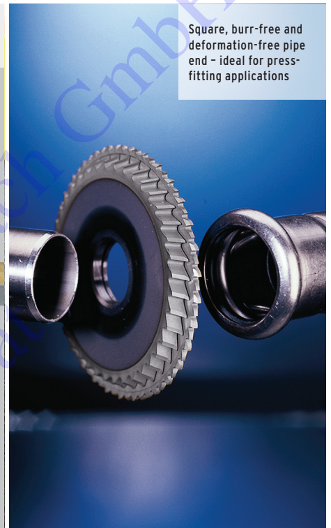
Square, burr-free and deformation-free pipe end - ideal for pressfitting applications

Our GFX series is the ideal solution for cutting of thin-walled tubes. The rugged design for a long product life makes the saws especially economical. Furthermore, the long tool lives thereby increase the productivity.