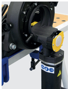
Second saw blade position to cut off elbows

Schweiss-, Schneid-, und Wärmetechnik - Spezialwerkstätte und Gaselager