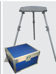
Tripod made of aluminum and high-quality padded blue shipping case for GFX 3.0 optional available