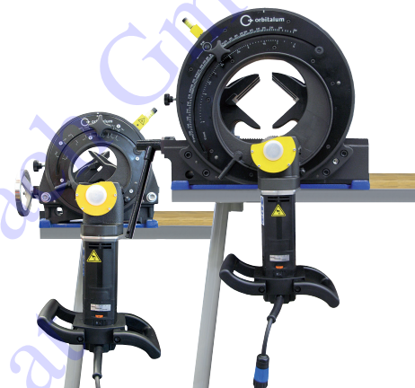
GFX 3.0, GFX 6.6

The technical data are not binding. They are not warranted characteristics and are subject to change. Please consult our general conditions of supply.