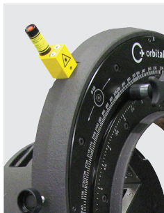
Integrated line laser to determine the cut off point