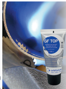
Saw blade lubricant GF TOP included