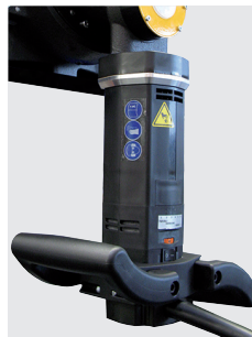
Powerful drive with electronic overload protection and ergonomically designed motor handle