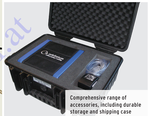
Comprehensive range of accessories, including durable storage and shipping case

The "Optical oxygen measurement via fluorescence extinction" method for welding technology (patent pending) is far superior to the conventional methods, using zirconium sensors: It requires no warm-up time whatsoever; reliably, quickly and precisely detects the oxygen share in the gas; unchecked alleged increasing of the measured value due to the formation of ozone is eliminated; the measurement is possible in all gas mixtures without manual switch-over (even with forming gas with a variable percentage of hydrogen).