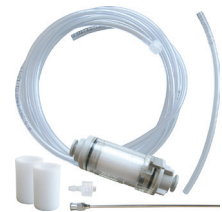
Measuring hose set (Individual parts)