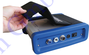
Practical protective cover included