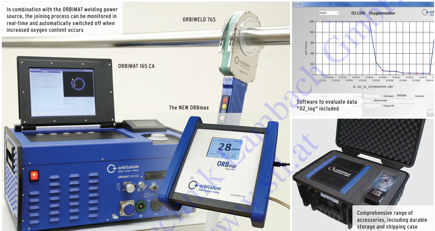
In combination with the ORBITAT welding power source, the joining process can be monitored in real-time and automatically switched off when increased oxygen content occurs

With Tungsten Inert Gas (TIG)-welding, oxygen as a protective and forming gas atmosphere is generally undesirable, as it is detrimental to the welded joint. This new ORBmax residual oxygen meter sets a milestone for fast, exact detection of residual oxygen, and with it complete documentation of these parameters. At the same time, the new measuring method results in greater efficiency and higher quality.