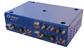
ORBITWIN 300 switching device

Including all connecting cables and hoses.