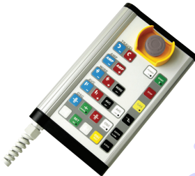
Remote control with cable