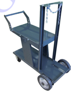
ORBICAR S trolley

The ORBICAR S is a practical trolley with storage shelf and an option of securing a gas cylinder. The ORBICAR S trolley can be combined with all power supplies of the ORBIMAT series. This trolley is often used in combination with the ORBITALUM 165 A orbital welding power supplies.