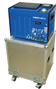
Durable storage and shipping case (ORBIMAT 300 CA not included in the scope of delivery)

With castors. Protects the power supply during transport. Perfect for the use on construction sites.