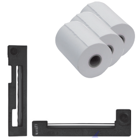
Paper rolls and ribbon cartridges for integrated printer