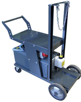
ORBICAR W trolley with integrated water cooling