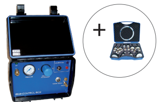
BUP control box (incl. ORBIPURGE forming set)

Including ORBIPURGE forming set for tube ID 12 - 110 mm (0.472" - 4.331"), see page 70.